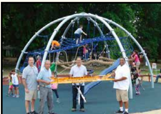
Fasola Park Ribon Cutting Ceremony