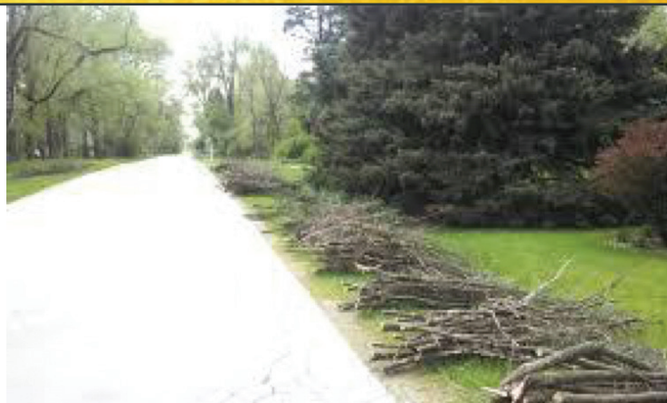
This is the proper way to place branches out for collection.

PLEASE NOTE: THIS SERVICE IS NOT OFFERED TO BUILDERS AND/OR CONTRACTORS. To schedule a prompt pick-up, please call (856) 228-4719 or visit www.deptford-nj.org .