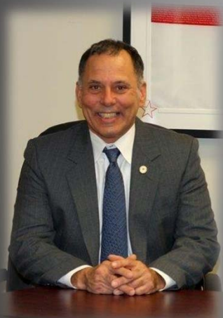
Mayor Paul Medany