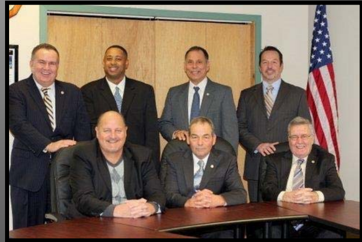
Mayor & Council ( left to right )

Let us show you what Deptford has to offer !